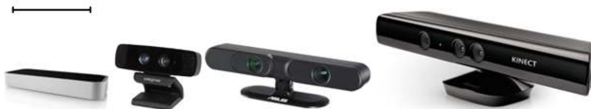
FIGURE 3: Different motion sensing devices roughly scaled to compare their sizes: from left to right Leap Motion Controller, Intel Creative Gesture Camera, Asus Xtion, and Microsoft Kinect; the scale bar is 10 cm.