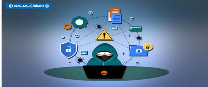
Fig. 1. Cyber Criminal