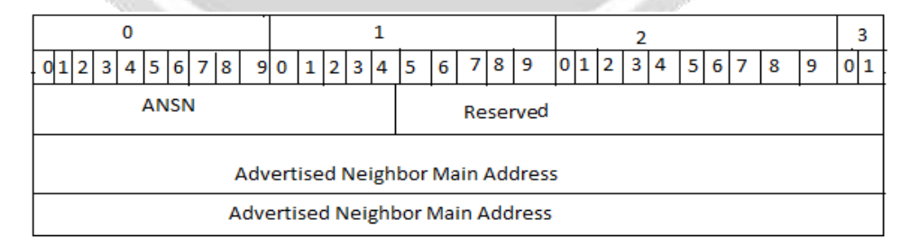
Fig. 2 TC Format [5]