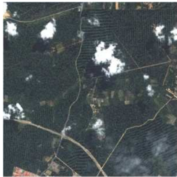
Fig. 2: A QuickBird satellite imagery taken from an oil palm plantation in Merlimau, Melaka, Malaysia

parameters (such as crop cover, crop health and soil moisture) and are useful for operations such as stress mapping, fertilization and pesticide application and irrigation management (Barnes and Baker, 2000; Barroso et al. , 2008; Hinzman et al. , 1986; Lelong et al. , 1998; Pal and Mather, 2003; Singh et al. , 2007; Tilling et al. , 2007; Yang et al. , 2003). Nutrient contents of different crops such as wheat (Lelong et al. , 1998; Silva and Beyl, 2005; Tilling et al. , 2007), paddy rice (Stroppiana et al. , 2008), sorghum (Zhao et al. , 2005), corn (Samson et al. , 2000), broccoli (Shikha et al. , 2007), citrus (Min, 2008), grape (Smart et al. , 2007), apple (Perry and Davenport, 2007) have also been assessed using hyperspectral and multispectral RS data. Interpretation of RS data is often aided by specialized techniques such as geostatistics, image analysis and classification, and artificial intelligence.