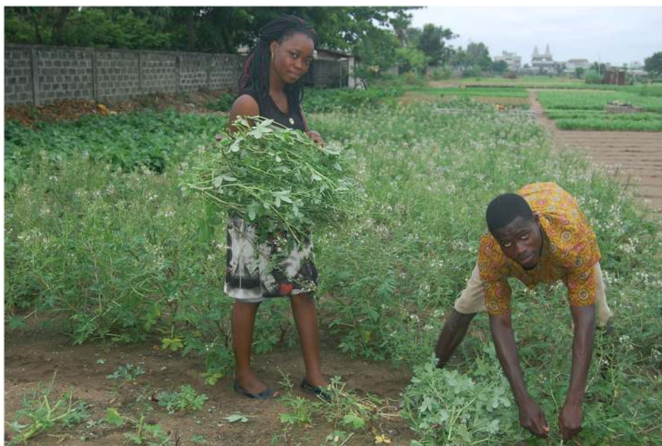
Fig. 2 Farmers harvesting Gynandropsis gynandra in a peri-urban garden (Benin)

variation in a wide range of metabolites. Analytical platforms include, but are not limited to: high performance liquid chromatography-photodiode array-fluorescence for apolar compounds (e.g., carotenoids, tocopherols, and ascorbic acid); liquid chromatography-mass spectrometry for semi-polar compounds (e.g., alkaloids, glucosinolates, flavonoids, and gallotannins); and gas chromatography-mass spectrometry for volatile compounds (e.g., amino acid derivatives, fatty acid derivatives, and terpenes). The results of such untargeted metabolomics methods may be combined with proximate and mineral analyses to finely characterize nutrient content variation in germplasm collections and guide selection. Results from such analyses will therefore provide rational nutritional targets in G. gynandra as well as a basis for meeting them. With proper passport data, intraspecific variation in metabolic profiles may also be linked with cultural and/or geographical information. Moreover, the discovery and identification of metabolites with health-promoting properties could motivate further pharmacological studies on the species and provide incentive for utilization of G. gynandra as a nutraceutical food. While there is available information on the nutritional value of orphan leafy vegetables 24,27 , such comprehensive analyses on natural variation in nutrient contents on wide germplasm collections are scarce and should be considered.