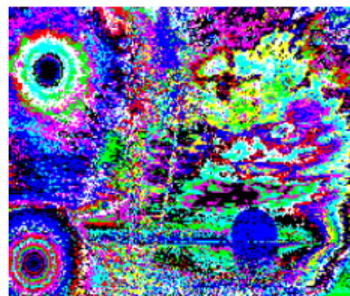
Figure 4. After using visual pixel detection.