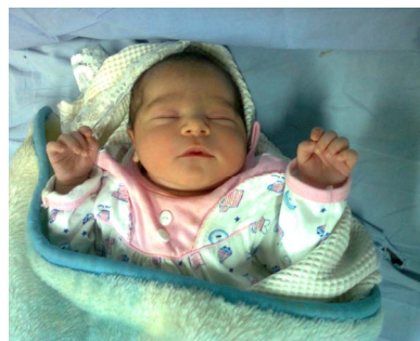
Figure 3. Original image with secret image.

The proposed method also is compared with Fridrich’s method [13], Y. Q. Shi’s method [14] and Z. M. He’s method [15]. The averaged results of four independent runs for different steganographic embedding techniques are shown in Tables 1-3 .