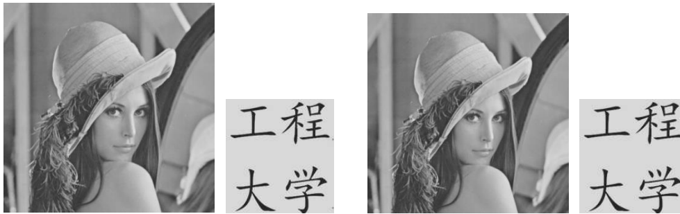
(a) Carrier image (b) Watermark picture (c) Watermarked image (d) Extracted watermark picture Figure. 4 Embedded and extracted images

The following experiments to determine the watermark algorithm for common attacks and geometric attacks robustness. Here, for the sake of simplicity, the embedded watermark is a randomly generated binary data of 64 bits in length.