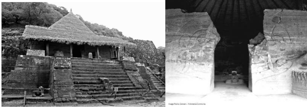
Figure ..9. The exterior of the Jaguar temple in Malinalco, located south of the modern city of Toluca. The image to the right is the interior of the temple (Image – Public Domain, Wikimedia Commons).

funerals of fallen warriors (figure 9). It consists of a rock cut structure with a rectangular and a circular chamber inside. The walls of which are constructed from stone set within a soil and lime mortar (Aguilar-Moreno 2007).