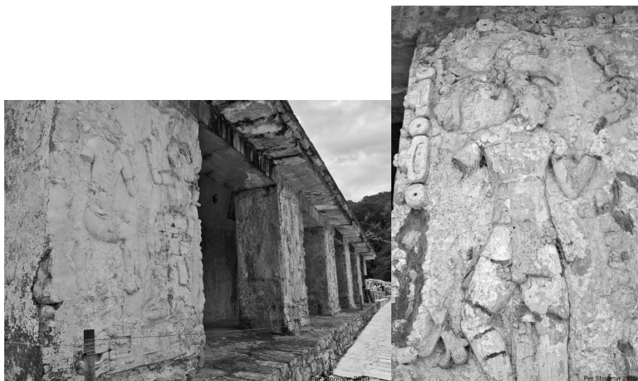
Figure .7. A plaster stucco relief from the Palace complex at Palenque in the foothills of the Sierra de Chiapas, dating to 250 – 700 AD