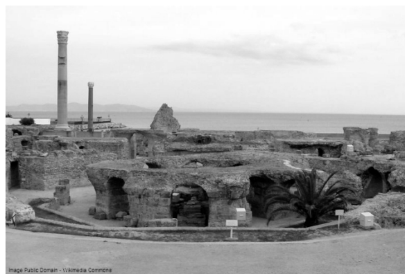
Figure .10. The ruins of Carthage, North Africa.

By 1500 BC trade between Egypt and Crete was established by the Minoans. Shortly after, the Phoenicians began to take the coasts of the Levant and Israel under their control, before establishing small trading colonies in North Africa in the 9 th Century BC (Manton 1988). These became the sites of towns such as Utica and Djerba; however the most well known Phoenician settlement in Africa is that of Carthage, established in 814 BC (figure 10); Carthage was the wealthiest city of the North African coast for 400 years. In 574 BC Carthage saw an increase in population as a result of the fall of the Phoenician capital Tyre to Nebuchadnezzar; this resulted in a spread of agricultural estates and a move away from the importance of coastal trade (Manton 1988). Many of these agricultural estates were dominated by large wealthy villas which were abundant in mosaics.