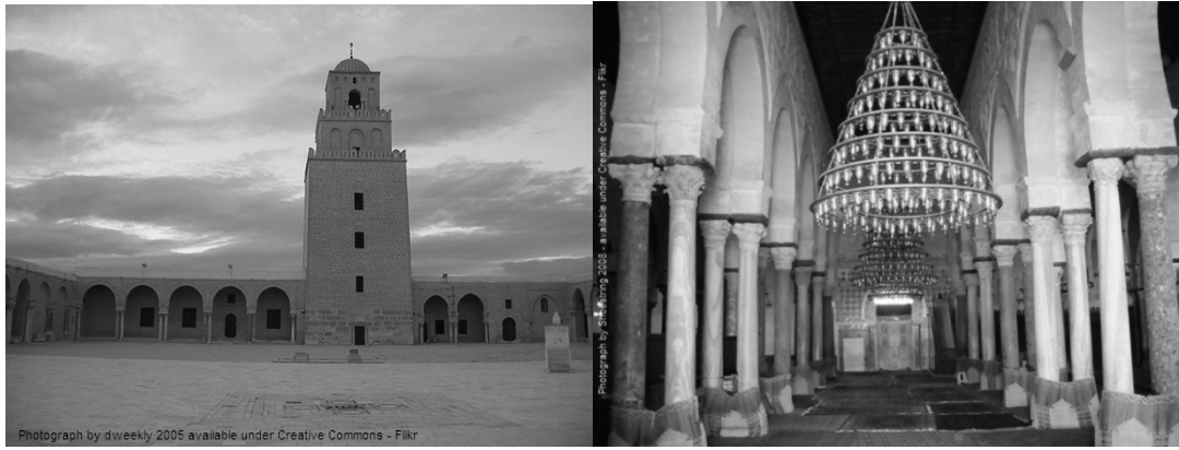
Figure ..11. The exterior and interior of the Great Mosque of Kairouan, built in 670 AD.