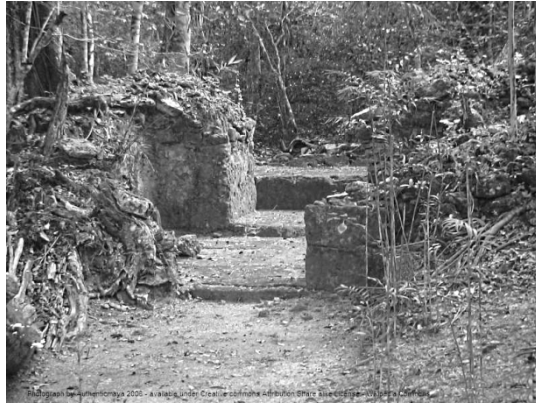
Figure .5. The ruins of Nakbè, Guatemala.