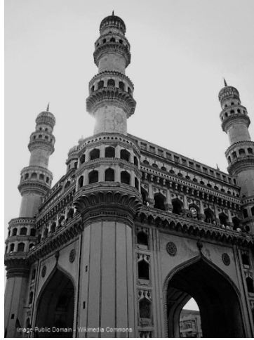
Figure ..3. The Charminar (Image – Public Domain, Wikimedia Commons)

It is rumoured that the chief architect responsible for the construction of the Charminar disappeared shortly into the construction. Upon his re-appearance a few years later, he gave the excuse that he had absconded only for the required period for the lime to mature (Ali 2001). The point made in regards to the maturation of the lime is an interesting one. Lime mortar can be made by slaking the lime and then leaving it or storing it as putty, instead of adding the aggregate immediately or turning the lime into a dry hydrate (dry hydrated lime powder). The lime putty develops a skin of carbonate which allows the material to be stored for a long period of time before use. The benefits of storing putty have been argued, but it is considered that the process of maturation increases the plasticity, workability and water retention of the final product. It is known that the Romans would often store lime putty for a matter of years, passing the supplies from father to son. So this supposition by the architect could be based upon an actual practice in India which is not referenced in other literary sources.