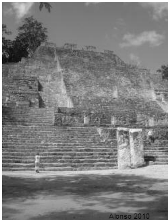
Figure .8. Structure II, Calakmul, from the Mexican state of Campeche. This is one of the highest pyramids built within the Mayan area and contains within it an earlier structure which has been found to house a monumental frieze made from lime plaster (Alonso 2010).

Many large sites contain large monumental structures which used lime as a key building material. An example of one such building can be found at the city of Calakmul in Mexico which was occupied from the Middle Preclassic period to the Post classic period (Folan et al. 1995). Many of these Mayan monuments also used lime plaster as a substrate prior to painting and as a modelling material. Within structure II at Calakmul (figure 8), exists an older building which has been found to contain a frieze representing one of the oldest examples of lime plaster technology within the Mayan world. This frieze which dates to 400 BC is 30 metres long by 3 metres high with a thickness of up to 12cm; figure depicts the temple in which it was found, however pictures of the frieze are yet to be released by the archaeologists for analysis (Alonso, pers comm.).