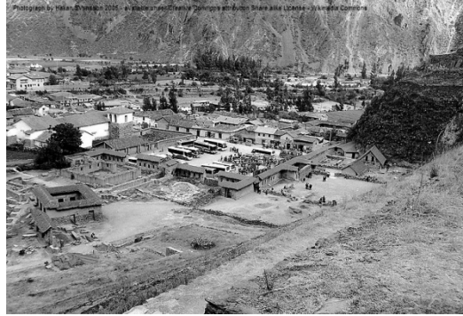
Figure 4. The main square in Ollantaytambo, Peru (Håkan Svensson 2005 – made available under the Creative Commons Attribution Share Alike License – Wikimedia Commons).

central courtyard. The Kancha's were often grouped together to form settlement areas within the cities, as can be seen at Ollantaytambo (figure 4), situated along the Urubamba River, Peru (Hyslop 1990).