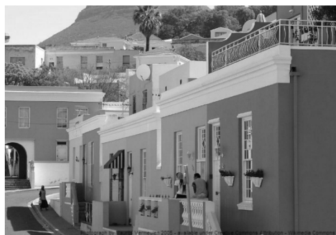
Figure ..13. Typical houses of the Bo-Kaap or Malay quarter of Cape Town, South Africa.

Cape Town's architecture reflected the Dutch fashions that occurred within the Netherlands; The Baroque buildings of the city consist of wings of rooms in a U, T or H plan that were plastered, limewashed and rooved with thatch (Binckes 1998). The Malay Quarter of Cape Town (figure 13) was home to the slaves and exiles brought in on the Dutch East India Corporation's ships. Here buildings were single or double storied and were built of soft brick with a stoep to the front; they were finished with plaster and whitewash (Binckes 1998). Many of the Victorian buildings of Cape Town were built with lime mortar and those that have stood the test of time have become popular dwellings for the wealthy. Several such buildings have been restored by private individuals or companies whilst others have been converted into museums and galleries (Binckes 1998).