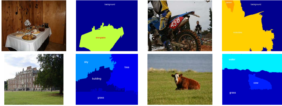
Figure 2: Sample segmentation results for the VOC07 and MSRC 21 databases.