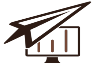
Figure 3: expLanes is an open source tool: http://mathieulagrange.github.io/expLanes

Moreover, evaluation can be a tedious, time-consuming (“do we have time to run another series of tests on this?”) and error-prone (“were these the exact parameter values I used during the last run?”) task. It should therefore be as automated as possible. With those aims in mind, we built an open-source tool called expLanes that greatly eases this process, by proposing a complete evaluation framework that strictly follows the scientific method, and automatically produces synthetic experiment reports.