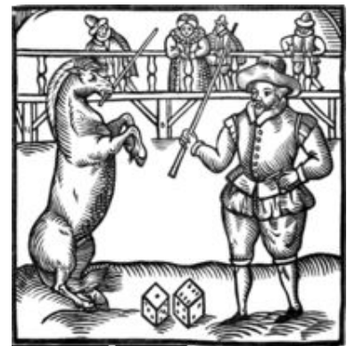
Figure 1: Hans is clever, but not quite: https://en.wikipedia.org/wiki/Clever_Hans

Less extreme, more common, and no less concerning, is the phenomenon of “Potemkin villages”, or systems that perform extremely well on a given dataset but fail to generalize. Leaving aside the “cherry picking” approach of specifically selecting data to show the system at its best, this can often happen due to a lack of care in ensuring the representativity of the evaluation dataset. This is for example the case in the field of environmental scenes modeling, where the Bag-Of-Frames (BOF) approach 2 was long