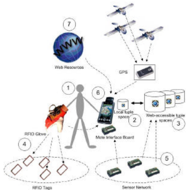
Figure 2. User centric infrastructure for browsing the world