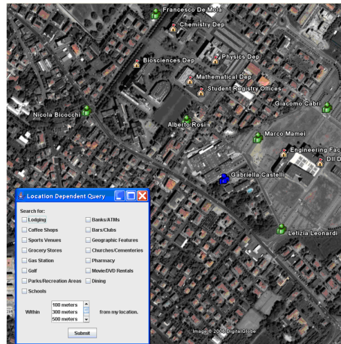
Figure 5. Map showing users real time locations with neighbor university facilities. (top) PDA user interface with the browser Minimo. (bottom) laptop user interface with Google Earth.