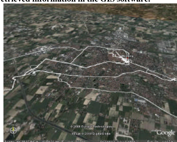
Figure 4. GUI showing user's past GPS traces