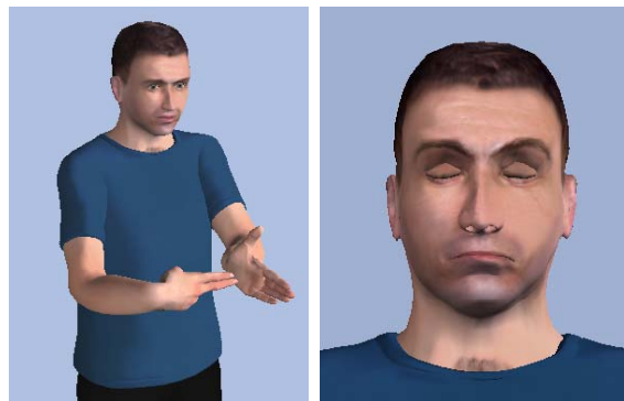
Figure 2. Example of VGuido animation

The gestures are represented by means of VGuido (the eSIGN 3D avatar) animations. An avatar animation consists of a temporal sequence of frames, each of which defines a static posture of the avatar at the appropriate moment. Each of these postures in turn can be defined by specifying the configuration of the avatar’s skeleton, together possibly with some morphs which define additional distortions to be applied to the avatar (Figure 2).