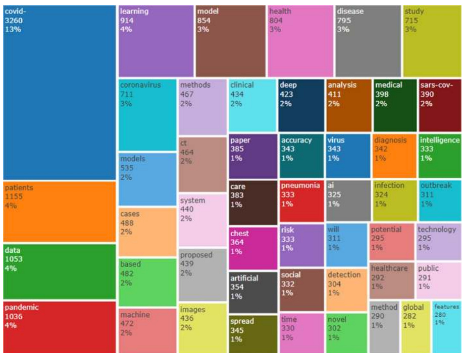
Fig. 1 TreeMap based on abstracts

To finalize the analysis of the keywords dynamics, in Fig. 1 we present a TreeMap taking into account the abstracts. The size rectangle denotes the frequency of the term. In this vein, “covid”, “patients”, “data”, “pandemic”, and “learning”, were the most frequent topics. Regarding the emerging technologies outlook, we recognize that related topics like “data”, “learning”, “models”, “machine”, “methods”, “system”, “artificial”, “deep”, “accuracy”, “analysis”, “ai”, “detection”, “intelligence”, achieved good participation. Therefore, it bolsters the suggestion that emerging technologies play an essential role to tackle epidemic outbreaks and other emergency situations.