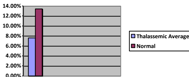
Estimation of Hemoglobin in Thalassemia Patients Figure 3