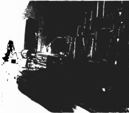
PHOTOGRAPH OF APPARATUS RESEARCH LABORATORY