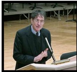
Dr. Howard Gardner

Dr. Howard Gardner believes that each person possesses all eight intelligences and that most people can develop each intelligence to an adequate level of competency. Intelligences usually work together in complex ways and there are many ways to be intelligent within each category.