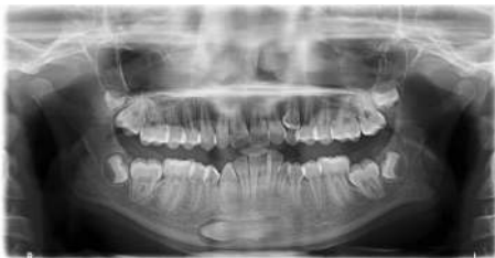
FIGURE 3: Panoramic radiograph depicting transmigrated mandibular left canine with enlarged follicle space showing Type 4 transmigration pattern (case 16). Overretained left maxillary and mandibular canines are present.