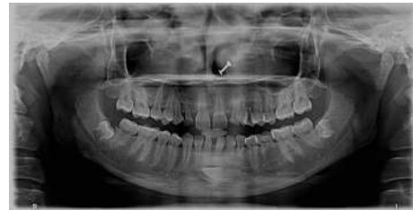
FIGURE 2: Panoramic radiograph depicting transmigrant mandibular left canine showing Type 2 transmigratory pattern (case 4) with retained deciduous maxillary canines and left mandibular second molar with agenesis of maxillary right canine and mandibular left second premolar. (Microdont maxillary lateral incisors are also visible.)

(0.61%). All the transmigrated canines were unilateral. Left-side predominance was observed for mandibular canine transmigration with 11 patients observing left mandibular canine migrating towards right side and four cases migrating from the right side towards left side ( P < 0.5 ). A similar finding was observed in maxillary canine transmigration with 3 cases depicting a left maxillary canine migration as compared to two cases depicting right side transmigration. There was presence of the retained primary canine with respect to transmigrated canine in seven cases (35.0%). The presence of other dental anomalies was present in 45% cases of transmigration ( P > 0.05 ). Applying Mupparapu's classification for mandibular canine transmigration (15 cases), Type 1 transmigration was the commonest type found in our study (10 cases), followed by Types 2 and 4 (2 cases each) and 1 case of Type 5 transmigration. No Type 3 transmigration case was found in the study. 2 cases (10.0%) of transmigrated canines had enlarged follicular spaces. All the patient's clinical and radiological features are summarized in Table 2. Only the tip of crown till approximate half of crown positioned in the median palatine suture was observed in 60% cases of transmigrant maxillary canines (Figure 7). Four maxillary transmigrant canines were positioned in a horizontal or perpendicular direction ( 80^\circ – 90^\circ ) to median palatine suture as compared to single case with mesioangular impaction (Table 3).