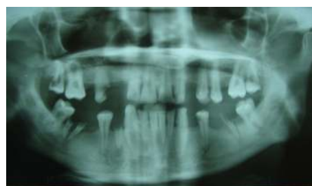
FIGURE 6: Panoramic radiograph depicting transmigrated maxillary right canine (case 11).

Similar to the findings reported by Aydin et al. [10], we also found that transmigrated canines occur more frequently in male patients (60%) than in female patients (40%). This finding was in contrast to a study conducted by Halcioglu et al. and González-Sánchez et al. who found a greater prevalence of transmigrated canines in females [15, 18]. In an extensive review by Sumer et al. they had postulated a slight female predilection (1.6:1) [19]. Aras et al. had, however, observed no gender predilection in their study of 6000 patients [12]. The reason for the gender predilection is not clear, though females typically tend to report frequently for aesthetics as compared to males [6]. In our study there was a marginally increased number of males (1695 males; 1305 females) that possibly could have resulted in greater number of transmigrated canines being observed in males, though no statistically significant difference was found ( P > 0.05 ).