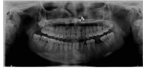
FIGURE 1: Panoramic radiograph depicting transmigrant mandibular left canine (33) showing Type 1 transmigratory pattern (case 1).

There were 20 patients (12 males and 8 females) observed in our study with transmigrated canines. The mean age of patients with transmigrated canines was found to be 24.1 years (age range 15–50 years). The overall prevalence of transmigration (maxillary and mandibular) was 0.66%. The prevalence of mandibular canine transmigration was 0.5% (15/3000) whereas the prevalence of 0.16% (5/3000) was recorded for the maxillary canine transmigration ( P < 0.05 ) (Figures 1, 2, 3, 4, 5, and 6). The results are summarized in Table 1. There was no statistically significant difference for gender with 12 transmigrant mandibular canines in males (0.7%) as compared to 8 subjects with transmigrant canines