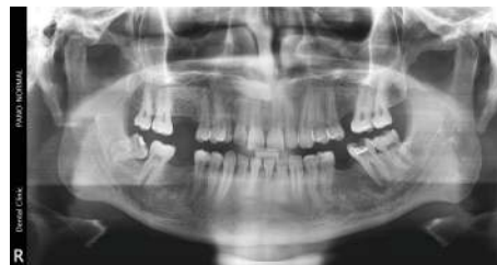
FIGURE 5: Panoramic radiograph depicting transmigrated maxillary right canine (case 20) with overretained deciduous right maxillary canine.

In accordance with the previous studies, a greater predilection of mandibular canine transmigration (0.5%) was observed in our study as compared to maxillary canine transmigration (0.16%). Aktan et al. had observed a similar predilection of 0.14% for maxillary transmigrated canines and found a prevalence of 0.34% for transmigrated mandibular canines, while Gunduz found a 0.1% prevalence of transmigrated canines in 12,000 patients [6, 7]. The prevalence of transmigrated maxillary canine (0.16%) found in our study was found to be similar to all the studies, though a greater prevalence of 0.44% was documented in one study [5]. The prevalence of transmigrated mandibular canine was, however, found to be variable ranging from 0.004% by Mupparapu [9] to 0.46% by Kumar et al. [8]. However, the overall prevalence of transmigration of 0.66% was found to be slightly higher than the other studies. Zvolanek's case series failed to find any transmigrated canines in 4000 individuals [17] whereas Javid had identified one transmigrated canine after examining 1,000 panoramic radiographs [2]. The difference in prevalence can be attributed not only to ethnic differences but also to type of the study population whether it is orthodontic or general population.