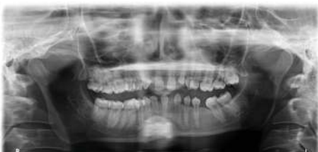
FIGURE 4: Panoramic radiograph depicting transmigrated mandibular right canine showing Type 5 transmigration (case 6) with agenesis of mandibular left incisors and right lateral incisor.

to transmigrated teeth, that focussed only on mandibular canines [8]. Transmigration, intraosseous migration of unerupted tooth, is a rare phenomenon [5, 6]. Early diagnosis with a timely orthodontic or surgical intervention can help dentists preserve the canines, which play an important role, in both aesthetics and function in the human dentition. The research on prevalence of transmigrated canines has been scarce with only a handful of studies conducted on this rare phenomenon (Table 4) [5–16].