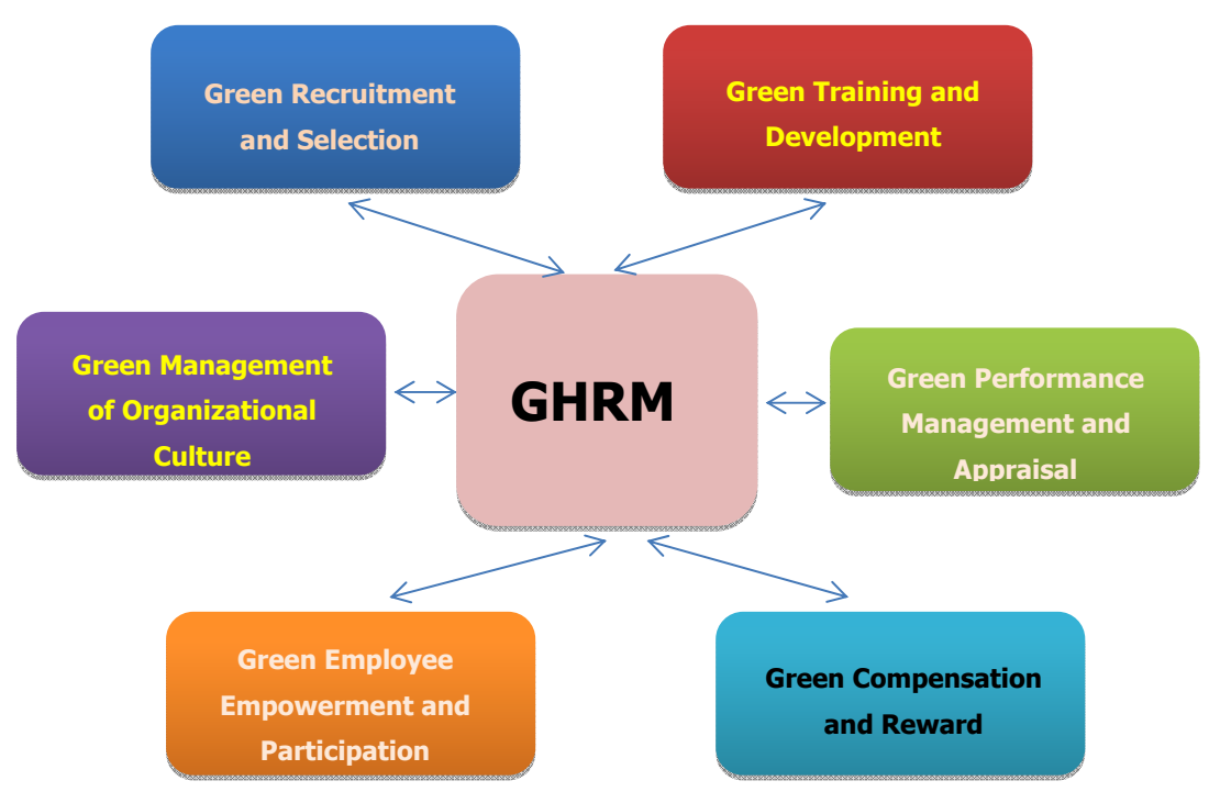
Figure 1. Green human resource management model

Creating awareness and developing GHRM practices, is not necessarily enough in achieving the optimal green initiatives. On the contrary, there is a need for an organization to embed these initiatives and policies onto its organizational culture through continuous appraisal. Asmui, Mokhtar, Musa, and Hussin (2016), notes that organizational green culture and organizational commitment are two key tools that different organizations must understand in order for them to remain sustainable. It is in this context, that the three authors document the need of the organizations to come up with appropriate strategies of measuring the two determinants from the perspective of the employees. This will assist them to have a better understanding of the different needs of the employees so that they are able to satisfy them accordingly. This will also help such organizations to identify the appropriate strategies to adopt in order for them to maintain the green culture of ensuring that the employees are committed to the green initiatives and focused towards the achievement of the set green goals.