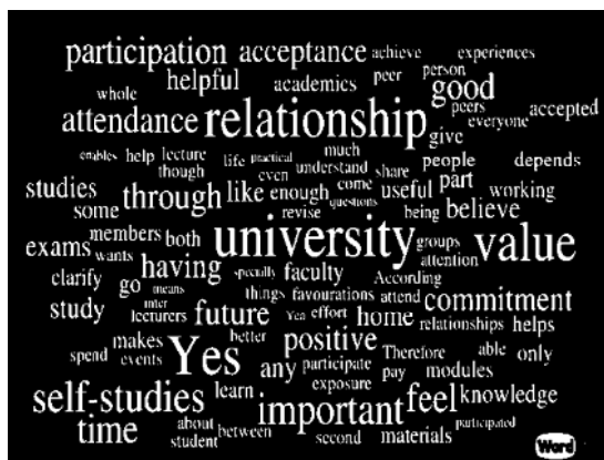
Figure 2. Word Cloud Results of ABC

According to the results for ABC University, it is seen that the words value, university, relationship, self-studies, participation and attendance have been highlighted. The word ‘value’ which comes under campus engagement, is highlighted since the word has been mentioned frequently. An example from the survey is below: