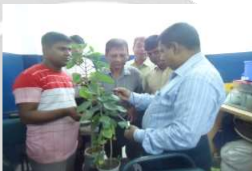
Fig.2 The measurement technique of the open circuit voltage for single pair

The measurement technique for double pair is shown in Fig.2. The Zn and Cu plates were connected in series combination. The connection was made by plastic costae, which was not tightly bounded.