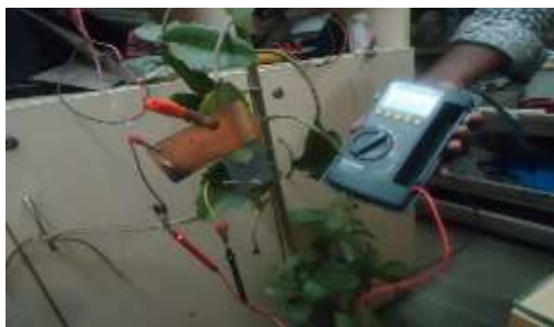
Fig.1 The measurement technique of the open circuit voltage for single pair

The measurement technique for double pair is shown in Fig.2. The Zn and Cu plates were connected in series combination. The connection was made by plastic costae, which was not tightly bounded.