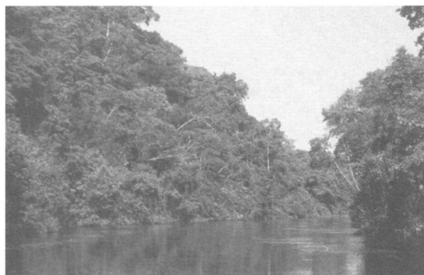
Plate 1 Vegetation along the Yenge River.