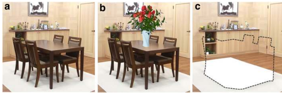
Fig. 1 Real, augmented, and diminished scenes. This figure shows differences between real (a), augmented reality (b), and diminished reality scenes (c). In augmented reality, real–virtual inconsistency mainly appears where real and virtual objects contact each other, i.e., geometric registration of virtual objects is one of the most important issues. From this point of view, in DR, real–virtual borders will appear all around the virtual regions since real regions surround the virtual ones

methodology, although image inpainting had been considered a computationally expensive process to be run in real time because the method repetitively searches and composes image patches to fill in missing regions [9, 10].