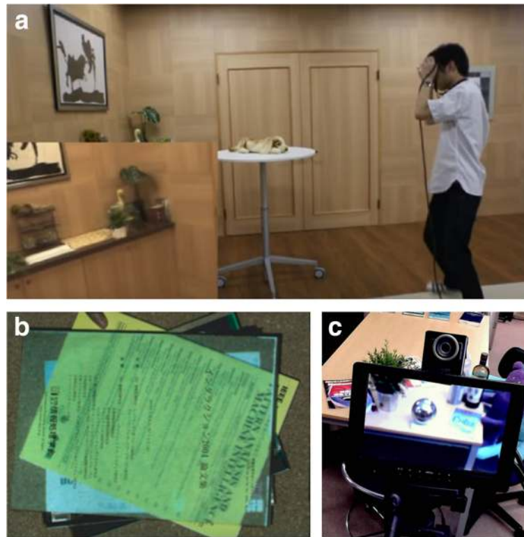
Fig. 3 See-through-based, projection-based, and tablet-based DR systems. This figure shows see-through-based [103] (a), projection-based [82] (b), and tablet-based [35] (c) DR systems