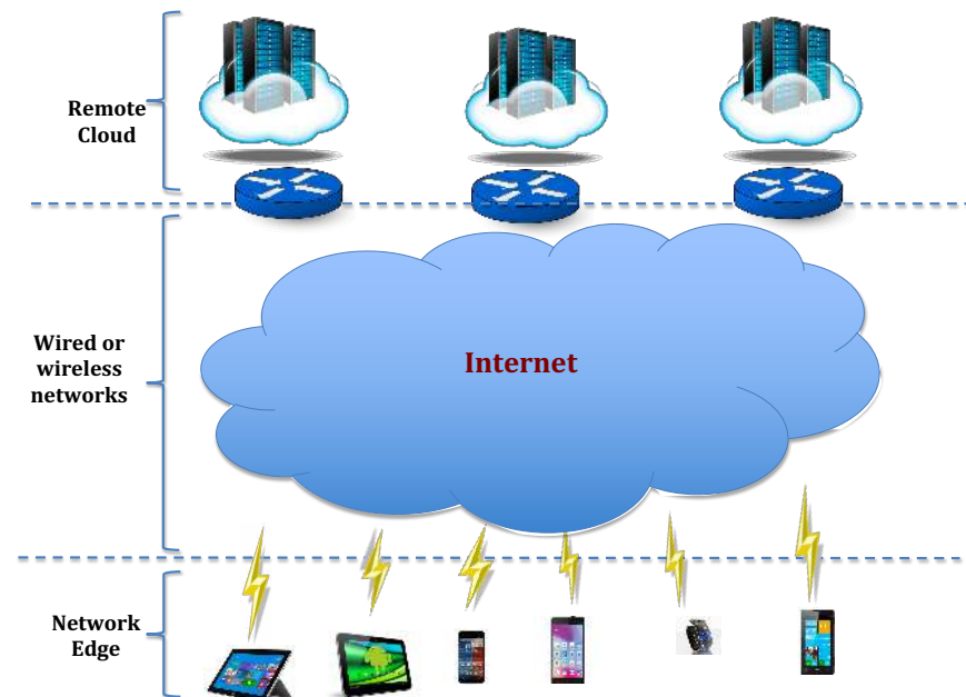
Figure 3. Illustrating the offloading path from the edge to the cloud.

in near real-time. In the light of our previous discussion, there is a critical need for an alternative computing platform, one that allows harvesting and aggregating the huge amounts of data generated by edge devices right there—at the edge [78].