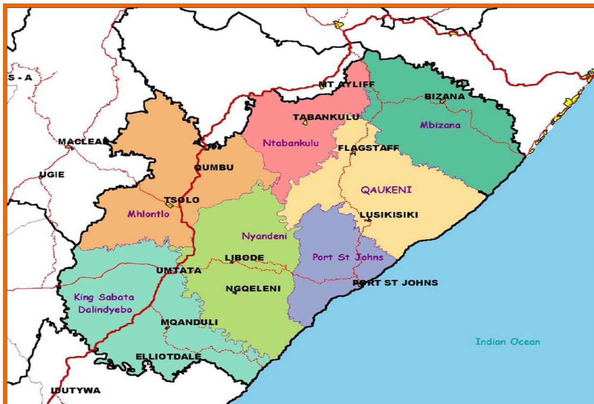
Figure 1. Map of O.R. Tambo District Municipality.

or unsuitable (Cunningham, 1993; WHO, 1978). Considering the relative ratios of traditional practitioners and university-trained doctors in relation to the whole population in African countries, traditional healers and remedies made from plants play an important role in the health of millions of people. The people are reliant on traditional healers who usually reside among them trusting their ingenuity on the use of herbs and some other cultural and traditional beliefs. These facts thus provide a role for traditional healers among the rural dwellers' trust.