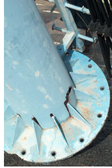
Fig. 2. Detail of the rupture at mid-height

On August 29, 2005, Hurricane Katrina struck the United States Gulf Coast and caused catastrophic damage to the combined telecommunications and power infrastructure. Devastating effects on both infrastructures hampered rescue efforts, blocked attempts to coordinate early responses, and made calls for aid impossible from the hardest-hit areas [28], [29]. White House Katrina Report described the results: “The complete devastation of the communications infrastructure left responders without a reliable network to use for coordinating emergency response operations” [28]. While it is tempting to view a catastrophe such as Katrina as an once-in-a-lifetime event, doing so would be an exercise in wishful thinking. Eight months before Hurricane Katrina, on December 26, 2004, the Indian Ocean tsunami highlighted the heavy human cost of communications breakdown during extreme events. While seismic monitoring stations throughout the world detected the massive sub-sea earthquake that triggered the tsunami, a lack of procedures for communicating these warnings to governments and inadequate infrastructure in the regions at risk delayed the transmission of warnings. However, based on the successful evacuation of the handful of communities that did receive adequate warning through unofficial channels, it is clear that better communications could have saved thousands of lives.