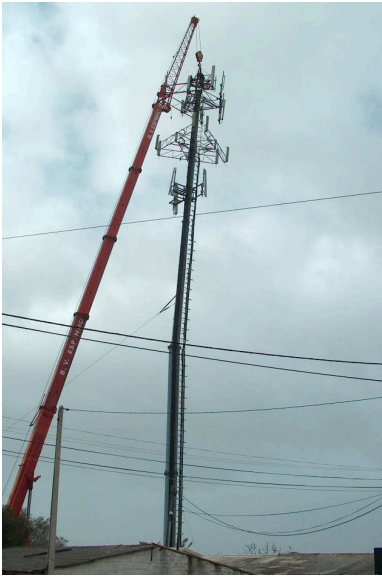
Fig. 1. Collapse of a 40-metre-high monopole