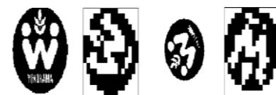
Figure 4: Two similar region shapes with different grid representation [8]

The advantage of the grid descriptor is it is very simple representation. The main problem of this method is major axis based rotation normalization. The major axis is sensitive to the noise. For example, the two similar shapes in figure 3 have very different grid representations. For the region based shapes, the grid representation is not rotation invariant. For example, the two shapes in figure 4 are similar shapes, but their grid representations are very different.