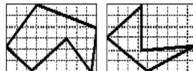
Figure 2: Grid representation of two contour shape [8]

The grid shape descriptor is introduced by Lu and Sajjanhar [8] . The shape image is divided into pixels(cells) and then scanned from left to right and top to bottom. The cells covered by the shape are assigned 1 and the cells which are not covered by the shape are assigned 0. So, the shape can be represented by the binary feature vector. The binary Hamming distance is used to measure the similarity between two shapes. For example, the grid descriptors for the two shapes in figure 2 are 001111000 011111111 111111111 111111111 111110011 001100011 and 001100000 011100000 111100000 111100000 011111100 000111000, respectively, and the distance between the two shapes will be 27 by the XOR operation on the two sets.