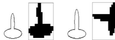
Figure 3: Two similar contour shapes with different representation [8]

To make this method translation, rotation and scale invariant, the shape is scaled into a fixed size rectangle, shifted to the upper left of the rectangle and rotated so that the major axis of the shape is horizontal.