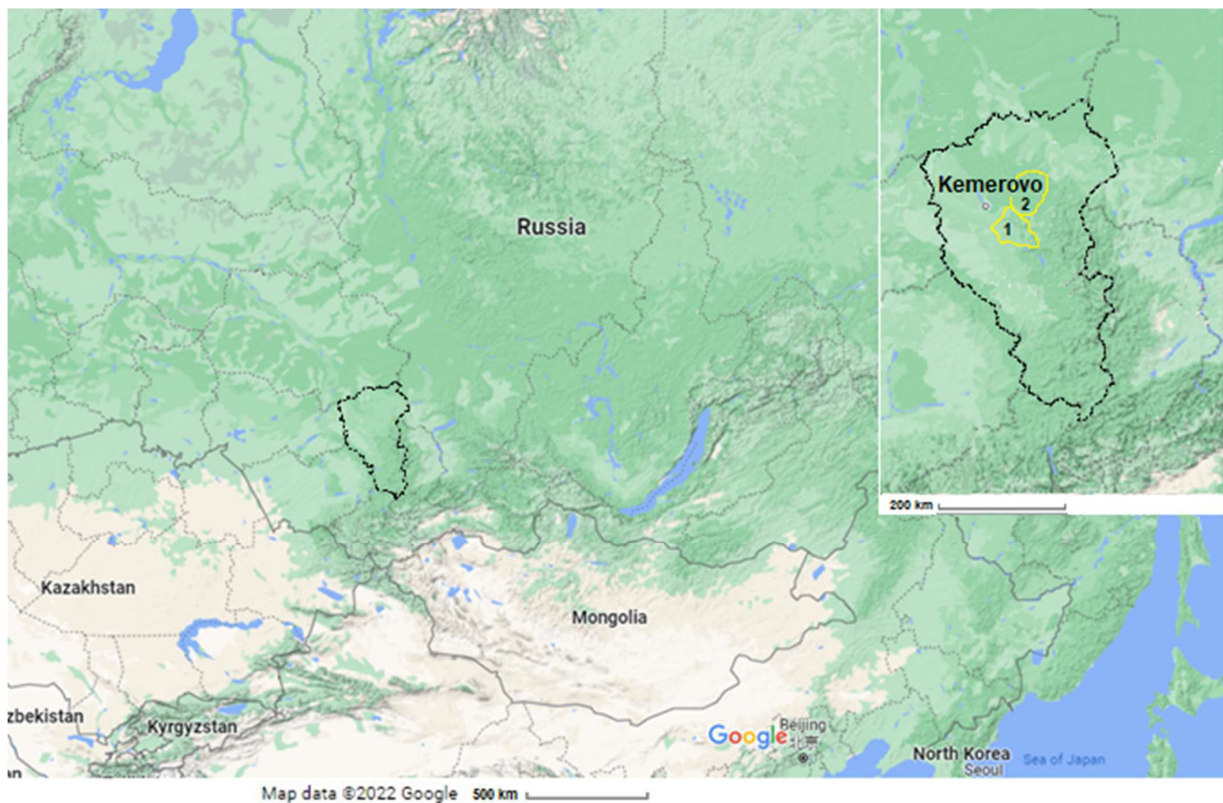
Figure 2. Monitored area: Kemerovo region—Kuzbass on the map of Russia. Source: https://google.com/maps/@55.4020429,80.4461703,5z/data=!5m1!1e4?hl=en (accessed on 30 March 2022); 1 and 2 are districts of the region where I, II, and III hunting grounds are located.