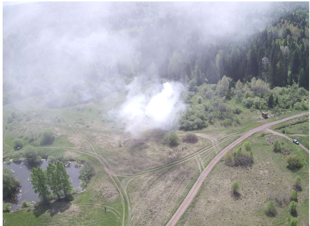
Figure 4. Drone in a forest-fire monitoring mission.