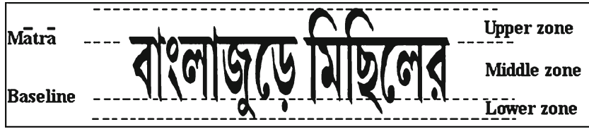
Figure 5. Different zones of Bangla text line.

are rarely used and some have become obsolete. Moreover, to simplify the complex shapes of compound characters, West Bengal Bangla Academy (BAN-ACA 2011) has introduced some new types of shapes to represent them. Nowadays, these simplified shapes of compound characters are used in Bangla textbooks. However, many newspapers and publishing houses do not always follow these new standards, as common people are still more comfortable with the old style of writing of Bangla compound characters. All these modifications add newer variations in handwritten character patterns, leading to further complexities in OCR of handwritten Bangla compound characters.