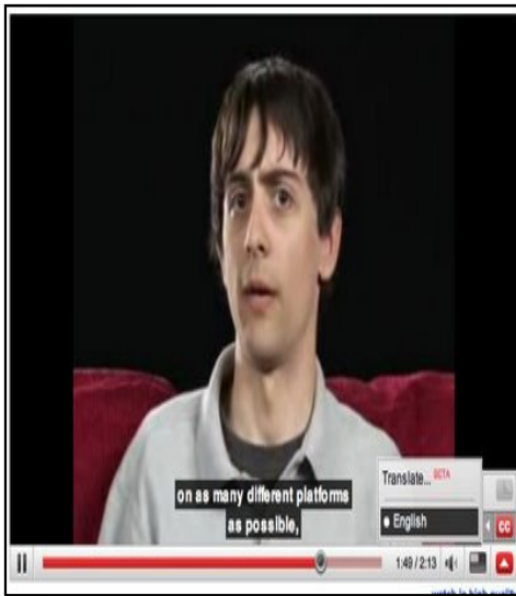
Figure 2: Caption Text Image