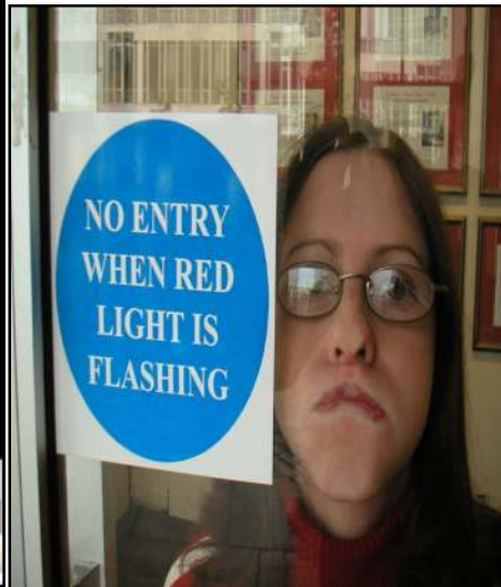
Figure 3: Scene Text Image (ICDAR Dataset)

Due to very fast growth of available multimedia documents and growing requirement, studies in the field of pattern recognition shows a great amount of interest in efficient extraction of text, indexing and retrieval from digital video/document images. Intensive research projects are performed for text extraction in images by many scholars. Text extraction involves detection, localization, tracking, binarization, extraction, enhancement and recognition of the text from the given image. Several techniques have been developed for extracting the text from an image. The proposed methods were based on morphological operators, wavelet transform, artificial neural network, skeletonization operation, edge detection algorithm, histogram technique etc. The methods cited in this paper on text extraction in images are classified according to different types of images.