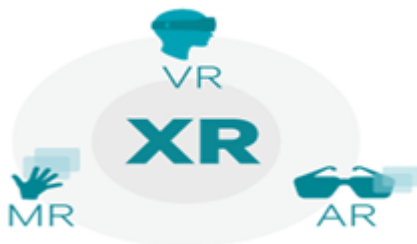
Figure 2 Extended Reality Diagram [19]

XR is a field that unification of phenomenal elements that cover AR, VR, and MR to provide new vision to learn new language in technocrats of the global village [18]. Extended reality is a new sensation technology along with VR, AR, and MR. Extended reality is a new sensation technology along with VR, AR, and MR shown in figure 2 [19].