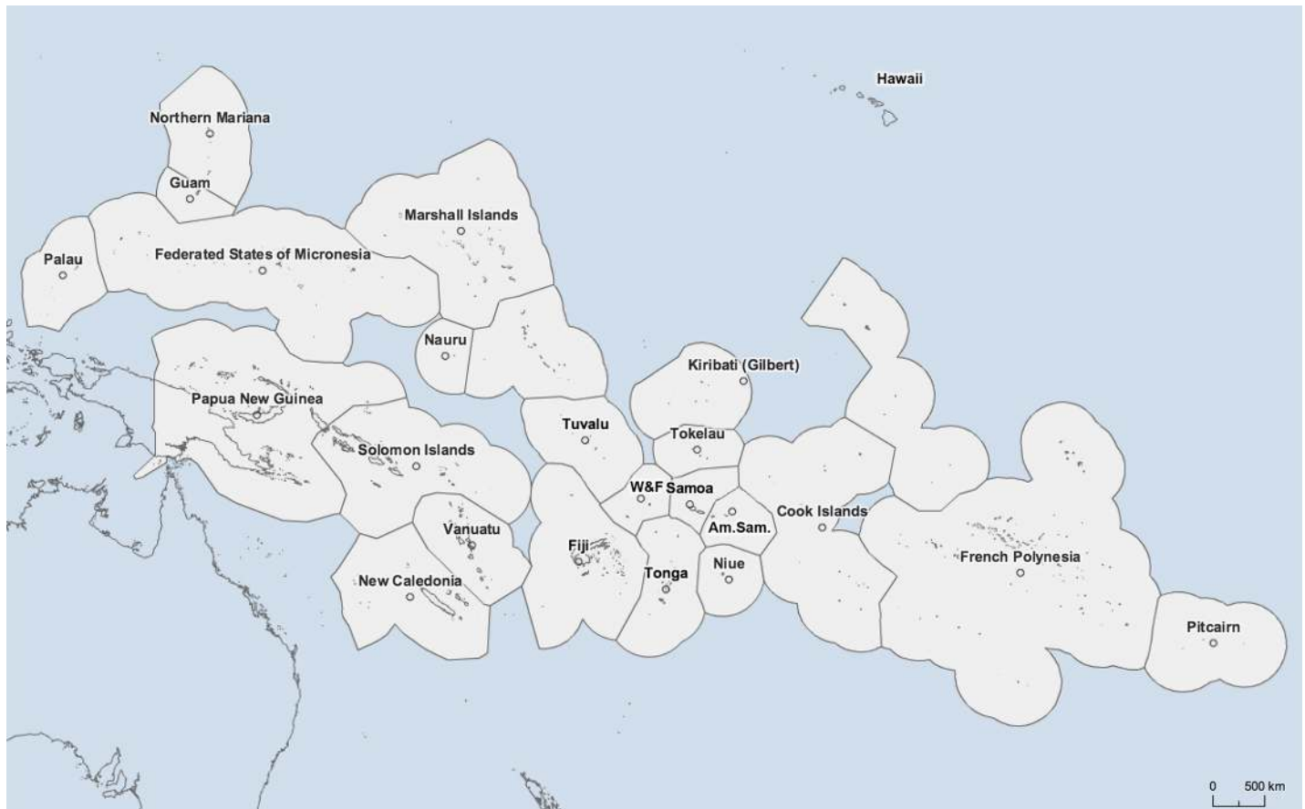
Fig 1. Map of the South Pacific region. All countries in Oceania were included in this review with the exception of Australia and New Zealand. Easter Island does not appear on the map but was included in our study. ‘W&F’: Wallis and Futuna. ‘Am.Sam.’: American Samoa. The map was provided by the Pacific Community (SPC) and is available online at: http://pacific.pogis.spc.int .

https://doi.org/10.1371/journal.pntd.0006503.g001