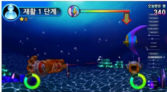
Underwater Fire Game