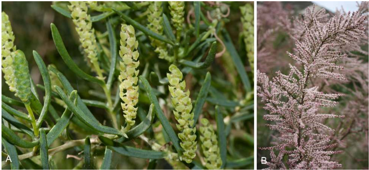
Fig. 7. A: Sarcobataceae : Sarcobatus vermiculatus (Hook.) Torr., Germany, Botanischer Garten Berlin, 29 Aug 2015, photo by N. Turland. – B: Tamaricaceae : Tamarix ramosissima Ledeb., Azerbaijan, Borsch & al. 5461 (B, BAK), photo by T. Borsch.

is databased. Once published, the continuously updated dynamic treatment will also be available as a freely accessible online data portal ( http://caryophyllales.org/ ).