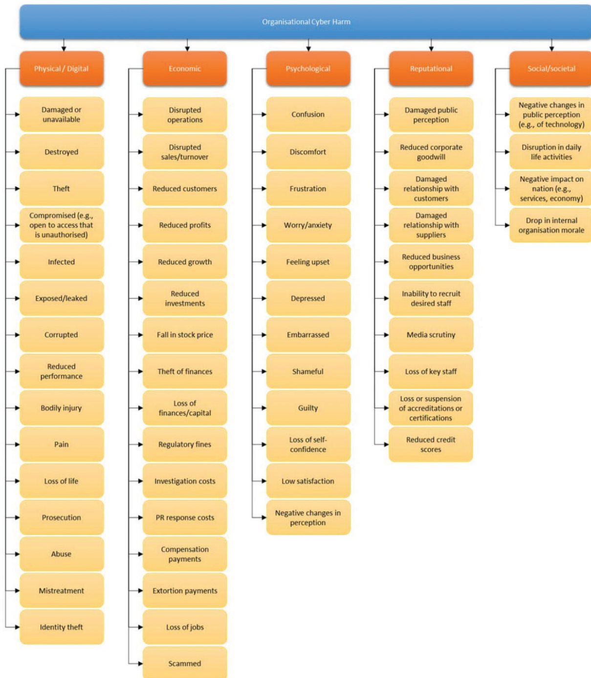
Figure 1. Taxonomy of organizational cyber-harms.

completely avoid the company. Social-media platforms such as Twitter can exacerbate this harm due to the great visibility they give to customers and the public [35]. This highlights a subset of the wide span of consequential harms, captured in the taxonomy, that result from cyber-incidents.