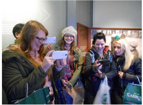
Fig. 1b. Test of marker-based AR