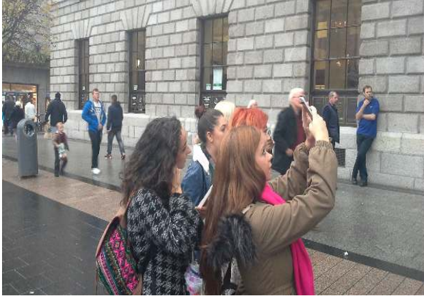
Fig. 1a. Test of GPS-based AR