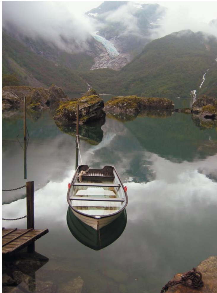
Folgefonna National Park, Sweden

Copyright © 2010 Massachusetts Medical Society.