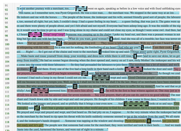
Figure 2: An example paragraph that contains multiple speakers from The Steppe

Figure 2 shows a screen shot of our annotation tool displaying a paragraph with a complex conversational structure from The Steppe .