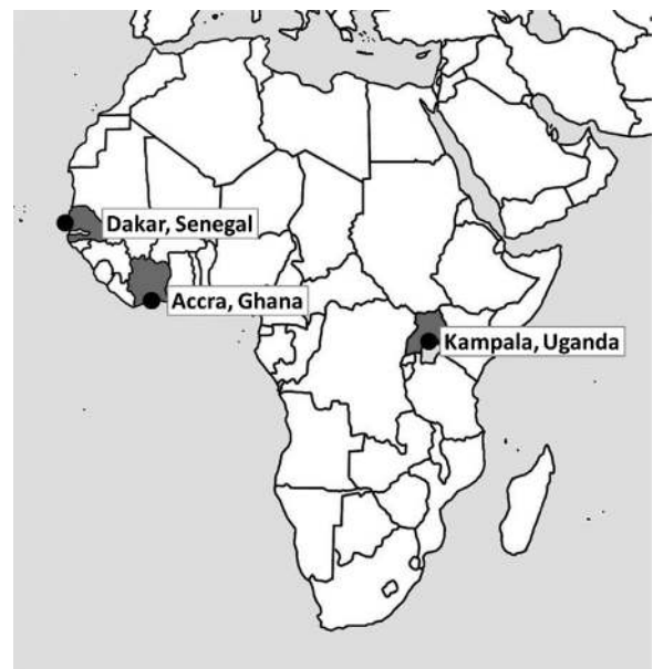
Fig. 1. Three cities in Sub-Saharan Africa where data was collected: Dakar, Senegal; Accra, Ghana; and Kampala, Uganda.

Approximately 1500 m 3 of faecal sludge is collected daily by private vacuum truck companies and delivered to the Cambéréne, Niayes, or Rufisque faecal sludge treatment plants where it is treated in settling/thickening tanks followed by unplanted drying beds. It is estimated that 6000 m 3 faecal sludge is produced daily, meaning the remaining 4500 m 3 of faecal sludge is disposed of directly into the environment (Bill and Melinda Gates Foundation, 2011). The total solids content of faecal sludge in Dakar is reported to be 3.5–4.5 g/l (Dème et al., 2009). Using an average value of 4 g/l