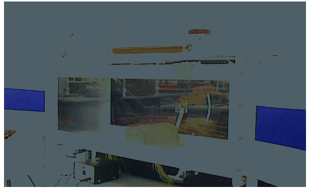
Figure 5. Wind tunnel models in test configuration.