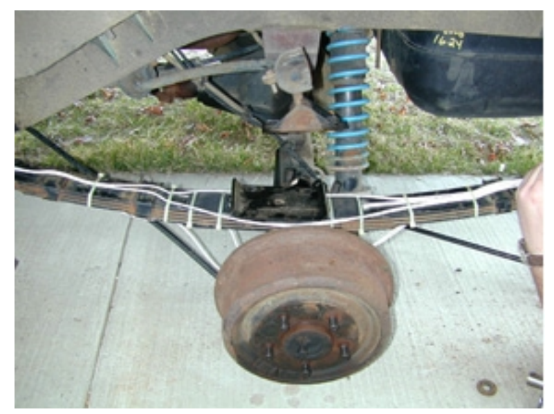
Figure 3. Strain gauge testing of an SUV leaf spring fitted with the Articulating Lift Block.

The constant application of unnecessary torsional stresses to the leaf springs degrade their mechanical integrity and ultimately affect the overall performance and longevity of the vehicle's suspension system. Elimination of the torsional stresses would not only improve the performance of the leaf springs but also the longevity of use. Accordingly, a junior student from the Department of Mechanical Engineering proposed an original design to eliminate torsional stress in the leaf springs. To develop this product, the student assembled a team of 4 ME students.