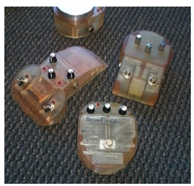
Figure 2. Guitar effects pedals from Spring 1999 Sophomore Engineering Clinic.

In the Spring 1999 Sophomore Engineering Clinic, 35 students took part in a guitar effects pedal product development project. The students were organized into 9 separate companies. In 16 weeks, each company designed, developed, tested and manufactured a fully operational and market-ready prototype. As shown below, the prototypes were manufactured using stereolithography and rapid circuit prototyping along with commercial-off-the-shelf components.