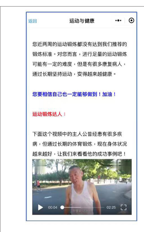
FIGURE 2 A text and video screenshot of a role model telling his story about gaining health benefits by engaging in jogging for several years.

Furthermore, patients will be invited to write down their PA diary and FVC diary in the My Diary sub-section under the Archive at any time starting from Week 9. Additionally, 3 RMB will be awarded to patients who complete at least three diaries for PA/FVC each week. In addition, the WeChat message will be conveyed to the patients 1 day before each weekly session to remind them to attend the intervention accordingly. The participation time, frequency, and duration of each learning activity in Module 1 and 2 will be automatically recorded by the backend system.