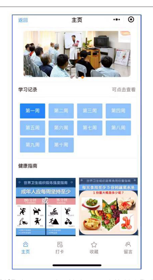
FIGURE 3 | The layout screenshot of the home page in Module 2. The four Chinese characters at the last row of the screenshot from left to right stand for four sections of Module 2: home page, check-in, archive and open forum.

In addition, to monitor lifestyle correlates, participants in the intervention group and control group will record their medication used, sleep quality, illness situation and participation in other health-related activities (e.g., attending health workshops) by writing a logbook once per week. The research assistant will give WeChat calls to the participants twice a week, aiming to check their diaries and identify whether they