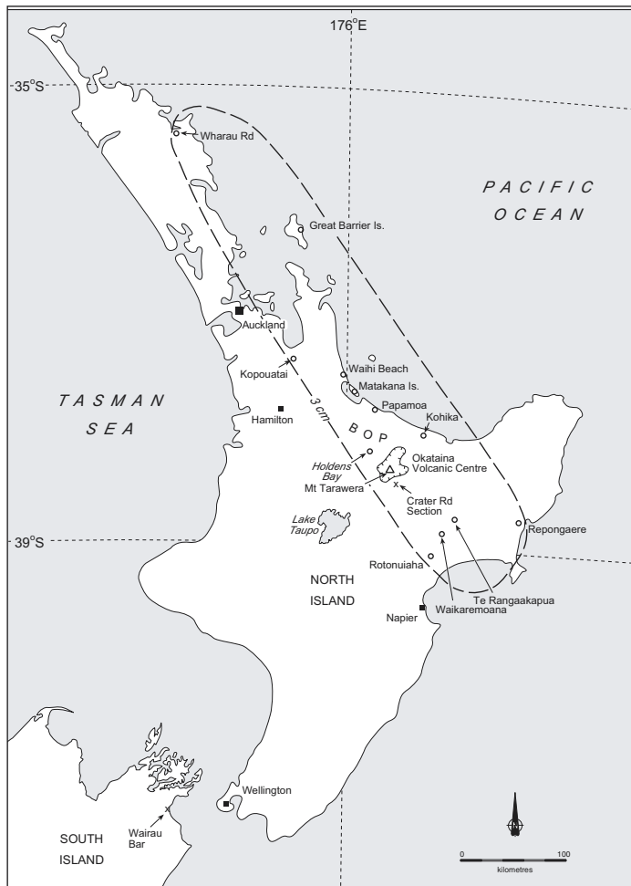
Figure 1. Locations of Crater Rd section (at metric grid reference V16/175197 on 1:50,000 New Zealand Map Series 260) and Mt Tarawera massif (source of the Kaharoa Tephra), and pollen profiles (open circles) containing the Kaharoa datum and Polynesian deforestation signals (after Newnham et al. 1998a; additional data from Elliot et al. 1997; Horrocks et al. 2001b). Isopach after Lowe et al. (1998). BOP, Bay of Plenty.

A key event for human prehistory in New Zealand is the eruption of the Kaharoa Tephra, a geochemically distinctive, rhyolitic tephra layer originating from Mt Tarawera volcano in the Okataina Volcanic Centre, North Island (Figure 1) (Lowe et al. 1998). Widely dispersed over at least 30,000 km 2 of northern and eastern North Island, Kaharoa Tephra provides a unique ‘settlement horizon’ ( landnám ) for prehistory in northern New Zealand. Although no cultural artefacts are recorded beneath it (Anderson 1991; Shepherd et al. 1997; Lowe et al. 2000; Horrocks et al. 2001b), the earliest human-induced environmental impacts, inferred largely from palynological data as described above, occur at around or just prior to its deposition (Newnham et al. 1998a; Lowe et al. 2000).