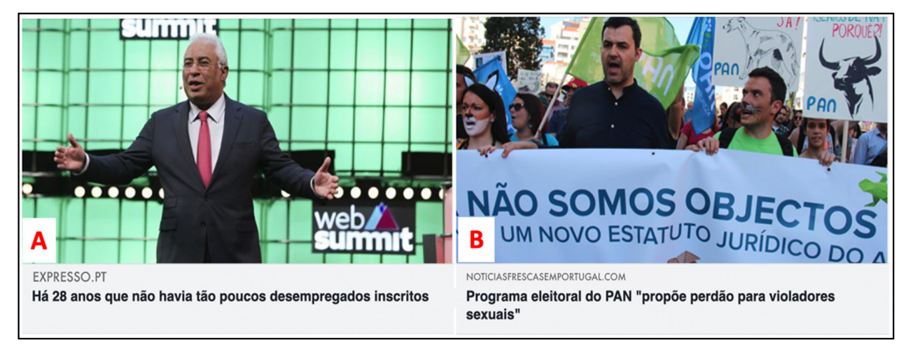
Figure 2. Presentation of news ( A ) and fake news ( B ) on Facebook. Note: The fake news format presented was adapted from the Portuguese fact-checking website, Polígrafo. Available on: https://bit.ly/3b8TzXz (accessed on 3 March 2022).

Furthermore, fake news often takes the same format that news presents when shared, especially on social networks, such as in the news feed (in the case of Facebook) or as a tweet (in the case of Twitter), which reinforces this perception. Just like a journalistic piece, a fake news appears on social media with title, image, signature/source (see Figure 2).