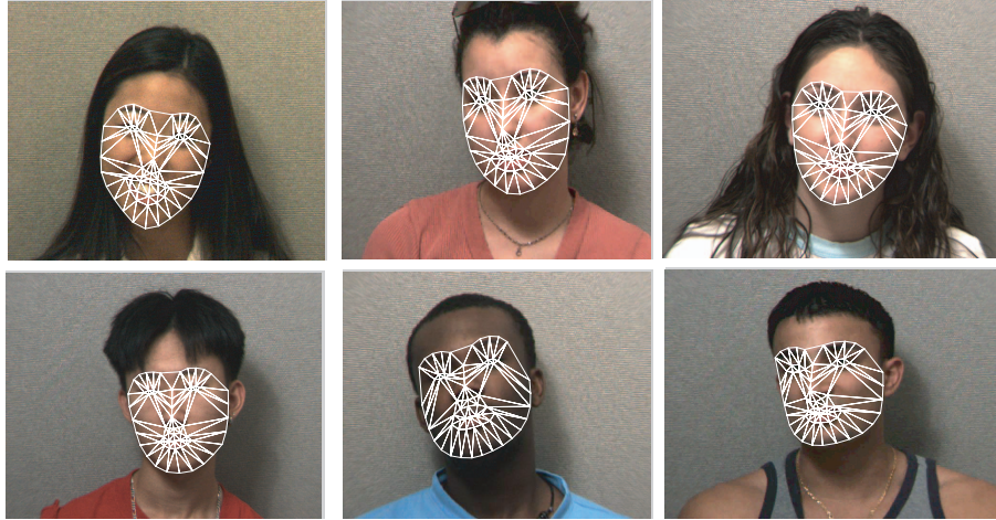
Figure 1: AAM shape registration examples across a number of subjects.

that for ease of presentation we have omitted any mention of the 2D similarity transformation that is used with an AAM to normalize the shape [7]. In this paper we include the normalizing warp in \mathbf{W}(\mathbf{u}; \mathbf{p}) and the similarity normalization parameters in \mathbf{p} . See [9] for the details of how to do this.