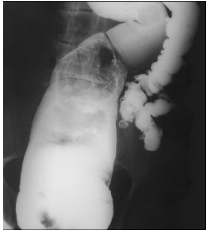
Radiograph showing megacolon secondary to rectal impaction

Management of constipation in patients with stomas should follow the principles outlined above, but it must be remembered that no sphincter exists. Suppositories should be held in place with a gloved finger, and enemas should be retained by inflating a Foley catheter balloon for 10 minutes.