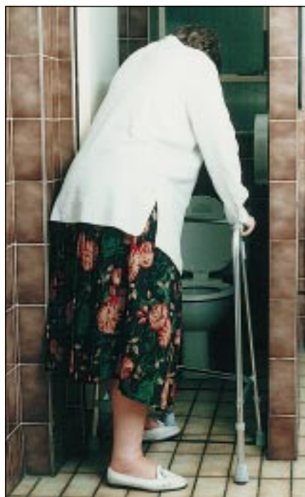
Access and ability to get to a lavatory may be more important in constipation than supply of laxatives