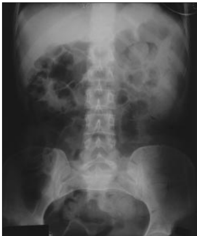
Radiograph of constipated patient showing stool masses and trapped gas

Assessment of constipation must include establishing in what way the present pattern of bowel movements is different from the normal pattern and a physical examination, including general observation, abdominal palpation, and rectal or stomal examination