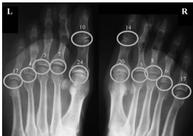
Figure 2. Localizations of foot joint abnormalities on oblique view. The circles represent the sites evaluated for radiographic abnormalities. Each number represents the number of patients with typical erosions at each site.

system developed by van der Heijde for posteroanterior views of the feet (15) to assess the 10 MTP joints and the 2 interphalangeal (IP) joints of the great toes. For both feet, the erosion score could range from 0–120, and the JSN score from 0–48. ETRA were evaluated by both readers (Figure 2), and disagreements between the 2 readers were resolved by a third reader (VD-P).