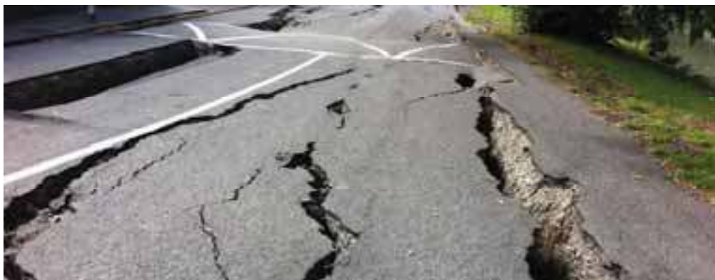
Damage caused by the 2011 earthquake in Christchurch, New Zealand

Damage is caused by the shaking or shearing of tree roots, the uplift of the ground surface, or changes in the water table (Allen, Bellingham and Wiser, 1999; Vittoz, Stewart and Duncan, 2001). The movement of soil or boulders downslope can also damage trees. Damaged trees may survive but they will exhibit signs of the disturbance such as fractures in the wood, growth suppression or the production of reaction wood (Vittoz, Stewart and Duncan, 2001). The diversity of earthquake impacts is a major source of heterogeneity in forest structure and regeneration. Some examples of recent earthquakes and their impacts on forests can be found in Box 4.