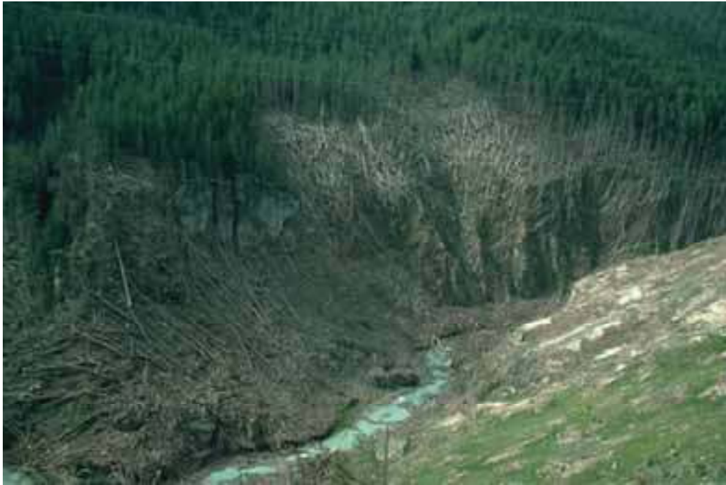
Damage caused by a large avalanche, Switzerland

greater structural diversity. Such communities provide valued habitat for various animal and plant species and can contribute to overall higher biodiversity. At a broader scale, avalanche tracks provide increased landscape heterogeneity and edge density and can serve as firebreaks.