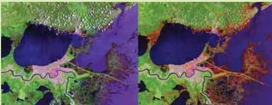
Satellite images of the New Orleans area, USA, before and after Hurricane Katrina. Healthy vegetation appears bright green before the storm, indicating growing trees (left); bright red depicts plant mortality just weeks after the storm (right).

It was predicted that Hurricane Katrina killed or severely damaged 320 million large trees in Gulf Coast forests and the resulting loss of carbon represented 50 to 140 percent of the net annual carbon sink of all forests in the USA (Chambers et al. , 2007). Initial estimates in Mississippi indicated potential timber losses of up to 84.9 million cubic metres across 1.4 million hectares of damaged forest land which corresponded to approximately 90 percent of standing timber in severe damage zones, and an average of 37 percent of standing timber across all damage zones (Oswalt and Oswalt, 2008). Hardwoods experienced severe bole damage and windthrow. In Louisiana's Pearl River basin, hurricane-related tree mortality was more than four times greater than annual pre-Katrina mortality rates (Chapman et al. , 2008). The estimated economic loss of timber from wind damage was between US$1.4-2.4 billion (Stanturf, Goodrick and Outcalt, 2007).