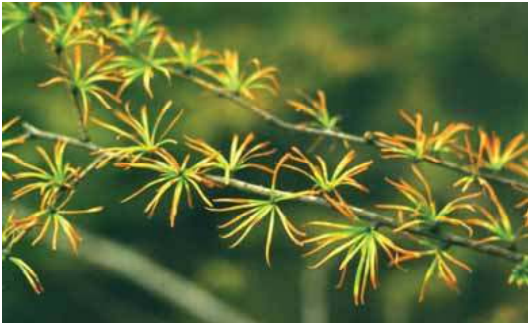
Air pollution damage to European larch ( Larix decidua ), Czech Republic

The deposition of atmospheric nitrogenous pollutants emitted from industrial, urban and agricultural sources is also of great importance in that they affect growth, biodiversity and biogeochemical cycles in forest ecosystems in many areas (Bytnerowicz et al. , 2008). Nitrogen oxides ( NO_x ) result in altered plant growth, enhanced sensitivity to secondary stresses, and eutrophication (Emberson, 2003). At low levels and in nitrogen-limited ecosystems, such as boreal forests, nitrogen may enhance growth. NO_x , ammonia ( NH_3 ) and nitric acid ( HNO_3 ) vapour may have direct phytotoxic effects but only at high concentrations (Bytnerowicz, Omasa and Paoletti, 2007).