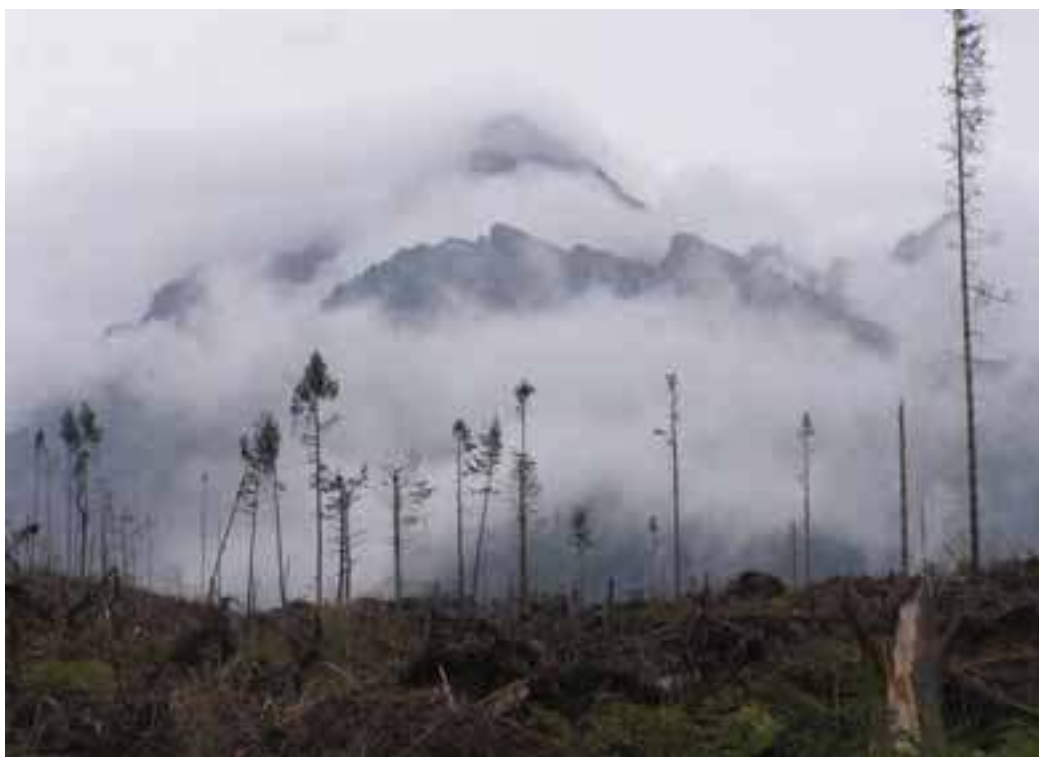
Storm damage, Slovakia

In some areas, storms have been causing increased damage to forests in recent decades (Schelhaas, Nabuurs and Schuck, 2003). In Europe, for example, storms cause more than 50 percent of all damage to forests and thus they have become such a major concern to the forest sector that the Directorate-General for the Environment of the European Commission commissioned a study into the problem.