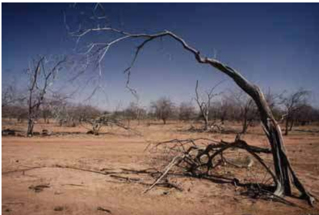
Dead vegetation in drought-stricken area, Senegal

Quaking aspen ( Populus tremuloides ) in Western Canada exhibited steep productivity declines and dieback after a particularly severe drought in 2001-2003, with effects continuing for years (Hogg, Brandt and Michaelian, 2008). Impacts were exacerbated by attacks of defoliating and wood-boring insects and pathogens (Hogg and Bernier, 2005; Hogg, Brandt and Michaelian, 2008). Steep growth declines and stand replacement of European beech ( Fagus sylvatica ) at the lower edge of its range has been observed in Spain and other southern European countries in response to drought (Jump, Hunt and Peñuelas, 2006). In Italy, Spain and Portugal native oaks are declining due to warming,