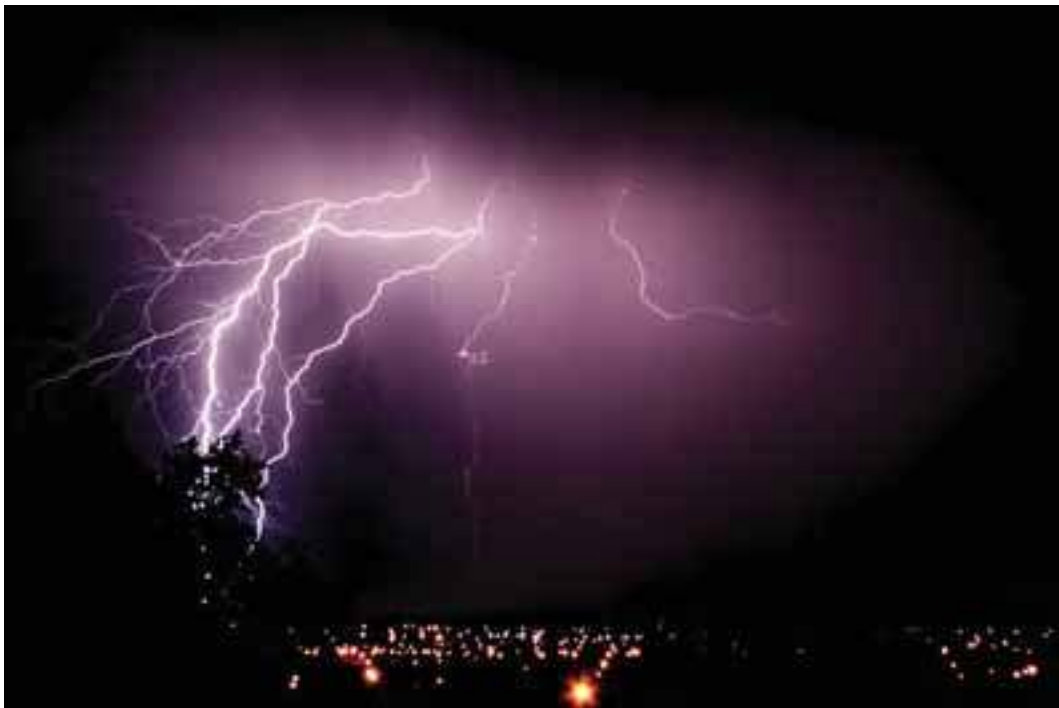
Lightning strikes, Canberra, Australia

Tall trees tend to be the most vulnerable to lightning strikes, especially those growing singly in open areas such as on hills, in fields, near water or in urban environments. The likelihood of a strike is greatest on exposed ridges, summits, slopes and other convex surfaces (Päätaalo, 1998). Lightning can impact a tree's biological functions and structural integrity. Along the path of the strike, sap boils, steam is generated and cells explode in the wood, resulting in strips of wood and bark peeling or being blown off the tree (Clatterbuck, Vandergriff and Coder, 2011). Trees may survive if only one side of the tree shows evidence of a lightning strike; however when the strike completely passes through the trunk, trees are usually killed. Many trees can suffer severe internal or below-ground injury despite the absence of visible, external symptoms when the lightning passes through the tree and dissipates in the ground (Clatterbuck, Vandergriff and Coder, 2011). Major root damage may cause the tree to decline and die. Lightning-induced mortality can create gaps in forest canopies (Magnusson, Lima and de Lima, 1996).