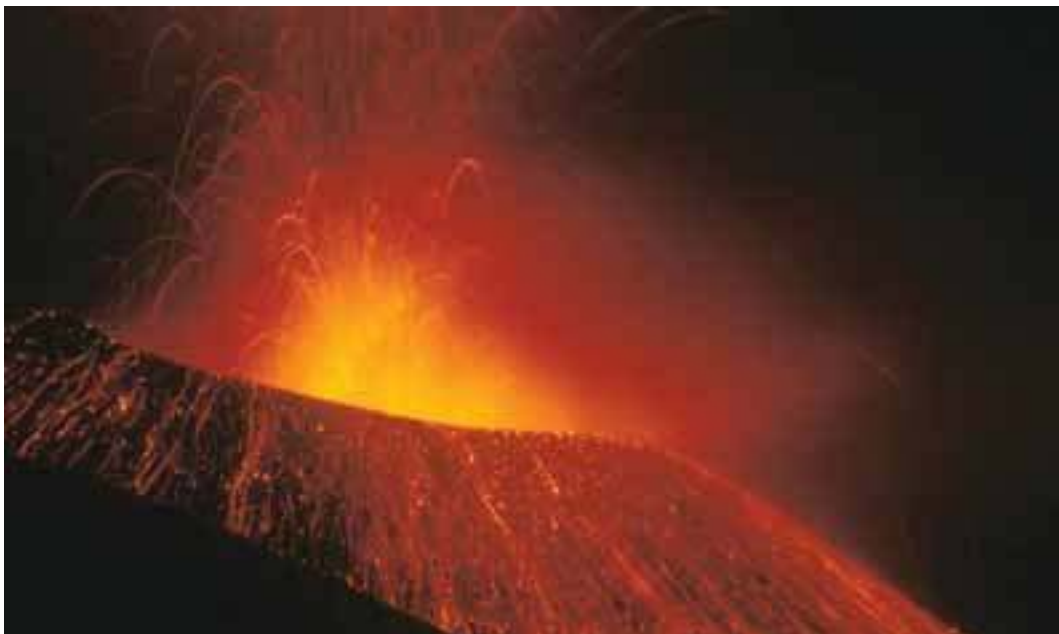
Chile's Lonquimay Volcano erupting

No viable seeds survived the debris avalanche or landslides and the very few surviving plants developed from rootstocks or stems that were moved by the landslide and came to rest near the surface (Turner, Dale and Everham, 1997). By 1994, vegetation cover on the debris avalanche had gradually increased from zero to 35 percent and was composed of early successional species with wind-dispersed seeds, a few conifers and red alder ( Alnus rubra ) (Turner, Dale and Everham, 1997). Mudflows washed away most of the understory vegetation and small trees; large trees, those taller