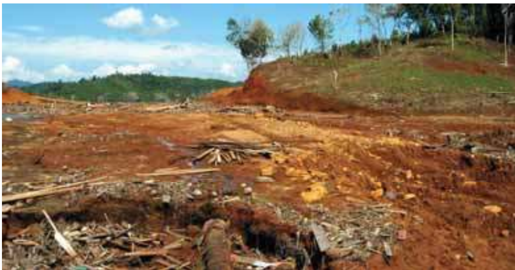
Soil erosion and debris resulting from the 2004 Indian Ocean Tsunami, Indonesia

In Indonesia, the hardest hit country, the degradation and conversion of mangroves into shrimp farms exacerbated the damage caused by the tsunami (Adger et al. , 2005; Srinivasa and Nakagawa, 2008; UNEP, 2005). It was estimated that almost 49 000 hectares of coastal forests (not including mangroves) were impacted by the tsunami representing an economic loss of US$21.9 million (UNEP, 2005). Approximately 90 percent damage to 300-750 hectares of mangrove forests was also noted representing a loss of US$2.5 million (UNEP, 2005). Only about 306 hectares of mangrove forests were impacted by the tsunami in Thailand representing less than 0.2 percent of their total area (Srinivasa and Nakagawa, 2008; UNEP, 2005). In some areas in Sri Lanka, large mangrove trees were uprooted and found far from the beach (UNEP, 2005). The tsunami also caused widespread impacts to mangroves and coastal vegetation in the Seychelles and the Maldives. Direct impacts to the mangroves were caused by inputs of sand and silt that covered the pneumatophores (breathing roots).