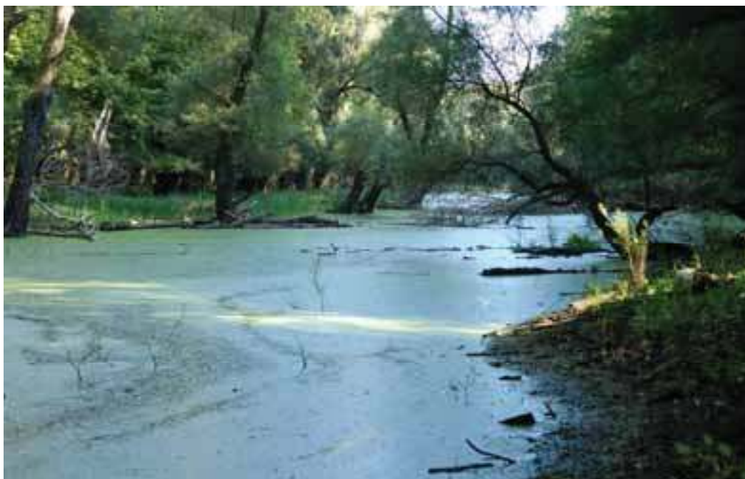
Flooded forest, Hungary

Flash floods can occur after heavy storms or after a period of drought when heavy rain falls onto very dry, hard ground that the water cannot penetrate (WMO, 2011). Such events may have much more impact on forests, especially in areas not accustomed to high waters.