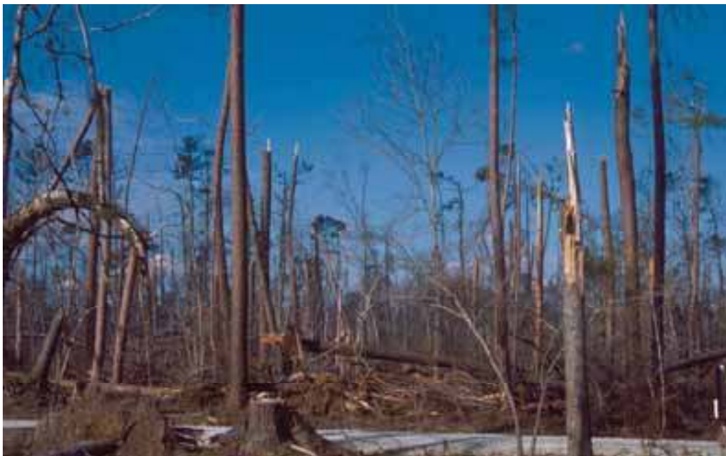
Hurricane Hugo damage, South Carolina, USA

As a tropical cyclone makes landfall its energy is transferred directly to coastal regions over a large area by high velocity winds, with effects extending inland for hundreds of kilometres during severe events (Stanturf, Goodrick and Outcalt, 2007). Three primary features of cyclones that cause damage are rainfall, storm surges and winds.