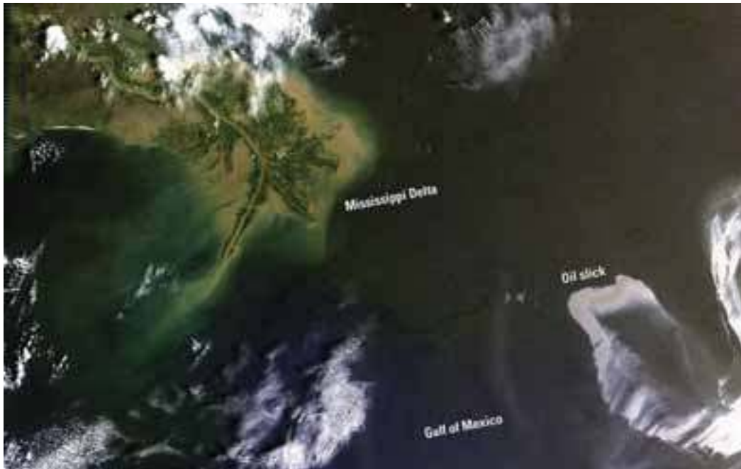
Oil spill in the Gulf of Mexico after the explosion of the Deepwater Horizon oil rig, 2010

The severity of the impacts of oil spills on mangroves are dependant on the amount of oil spilled, the type of oil spilled (including additives), the amount of time the oil remains near the mangroves, and the weathering time of the oil itself (NOAA, 2010). Lighter oils are more acutely toxic to mangroves than heavier oils and increased weathering generally lowers oil toxicity.