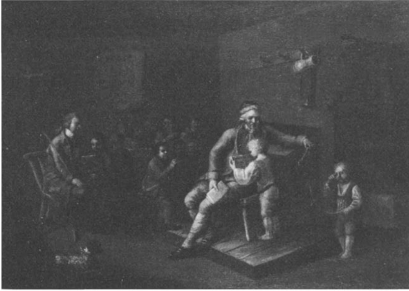
An Austrian parish school classroom (ca. 1750).