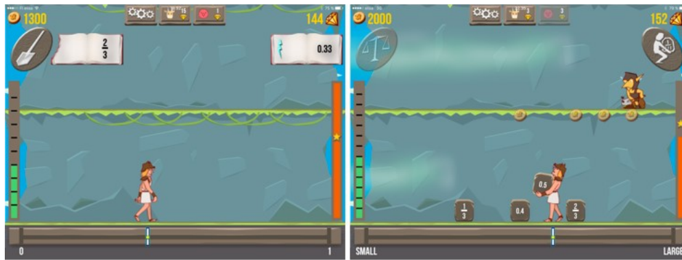
Figure 1. Left chart: An example of a number line estimation task in which the player should dig up a coin cache at the location reflecting \frac{2}{3} and avoid a trap at location \frac{1}{3} . Right chart: An example of an ordering task including both fractions and decimals; orange bar on the right side of the screen reflected the health bar that shows how much virtual energy is left