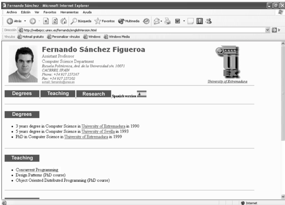
Fig. 1.a. Web page in a usual Web Browser

Figure 1.a shows an example of a web page in a usual web browser, and in Figure 1.b the same page is shown in WebTouch. All the elements shown on the page, figure 1.b, are icons. There is a special mouse also developed in the context of KAI, PinMouse, with two cells of pins. When the mouse is over an icon the pins raise in such a way that the user can know the kind of element below the mouse. The pins also give information about the accessibility of the element. For example, if the element below the mouse is a table, one can obtain information such as if the table has a summary or a title or appropriate headers.