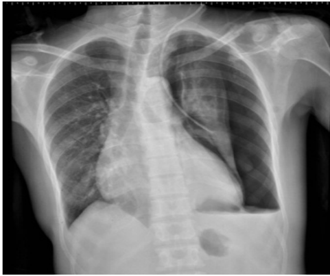
Figure 1: Chest radiograph showing left IJV catheter tip overlying left collapsed lung field with hydropneumothorax

the vein suggesting possible thrombus. An incidental diagnosis of left PAPVC was established. Line was removed so was the chest tube once the lung fully expanded. Echo cardiograph did not demonstrate any other cardiac anomaly like atrial septal defect (ASD), left ventricular hypertrophy, pulmonary arterial hypertension.