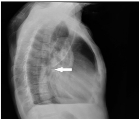
Figure 2: Lateral chest radiograph showing abnormal posterior course of the central venous catheter (white arrow)